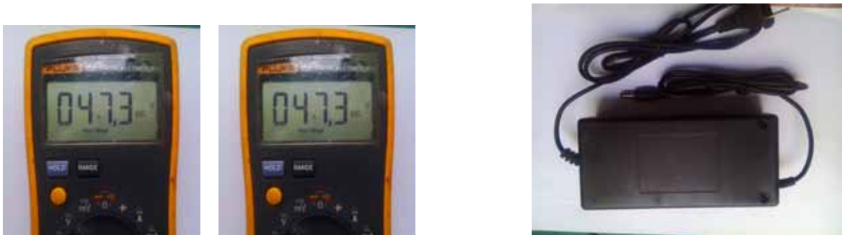
Figure9 : The charger connected to the charging protection device is negative charge

Use gaskets or insulation can work with gelatin sponge or barley paper insulation