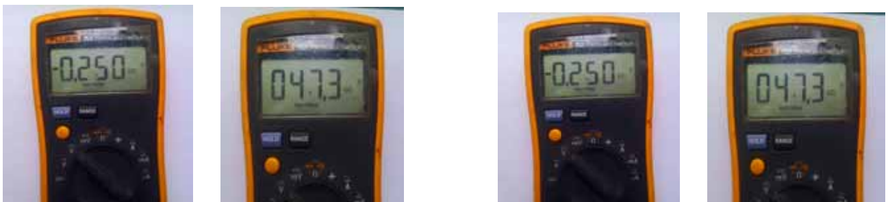
Figure8 : Comparing figure 6 and figure 7 record voltage consistency